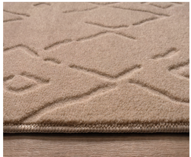
1007 DARK BEIGE