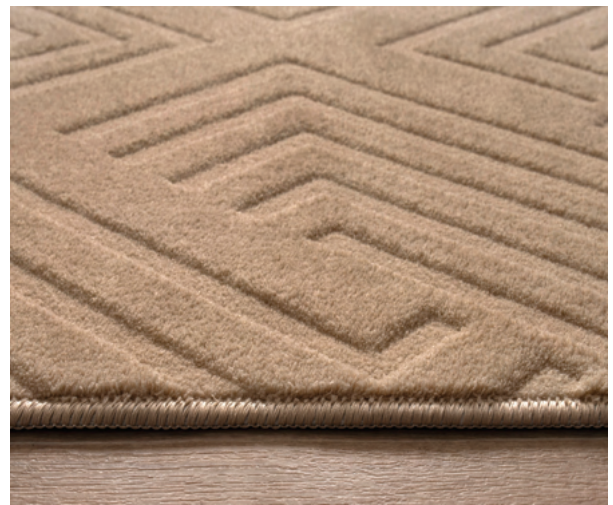
1010 DARK BEIGE