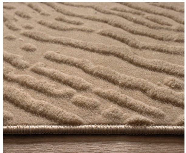
1008 DARK BEIGE